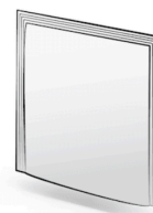
three side sealed bag