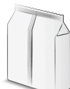
side gusset bag