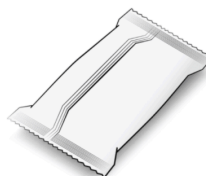
pillow printed pouches