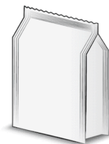
block bottom bag