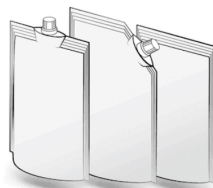
printed stand up pouch